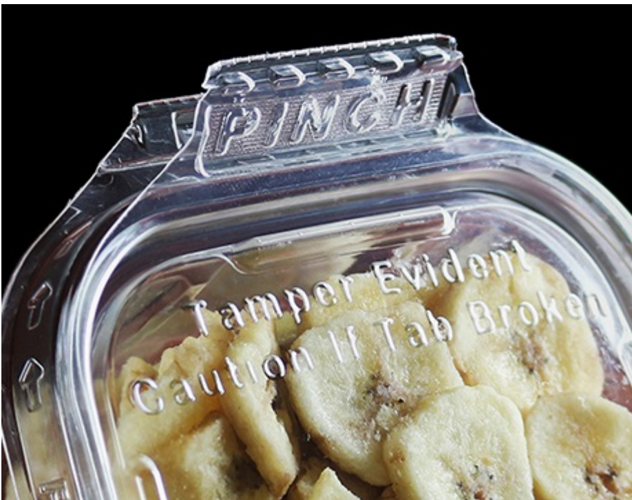
Consumer Alert Message